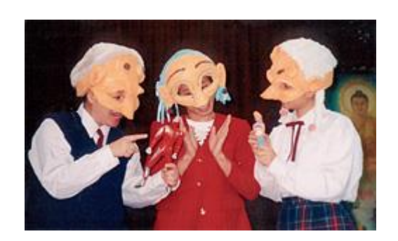
Inspired by a drama performance presented by Concealed Life, students are eager to voice out their views on gender roles in a traditional family.